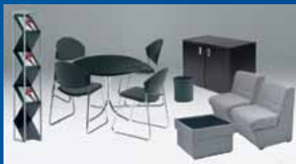
C: Furniture option C

Meeting table with 4 chairs, 1 counter cupboard with stool, 1 literature rack, 1 bin £349 + VAT