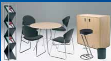
B: Furniture option B

Meeting table with 4 chairs, 1 cupboard, 1 literature rack, 1 bin £299 + VAT