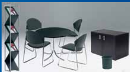
A: Furniture option A

Customise your booth with one of our furniture packages.